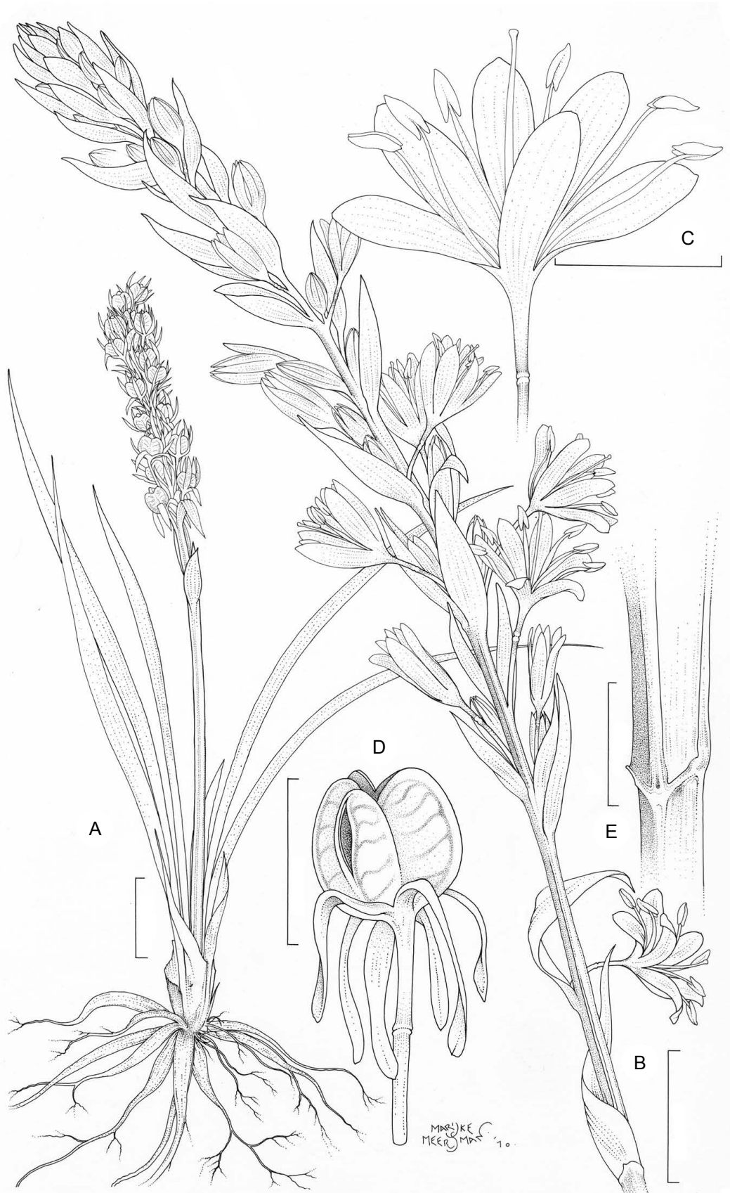
Figure 1 – Chlorophytum burundiense : A, habit (Baudet 304); B, inflorescence (Lewalle 3998); C, flower (Valière BR 848048); D, fruit (Lewalle 5131); E, pedicel (Lewalle 3998). Scale bars: A, 2 cm; B, 1 cm; C & D, 5 mm; E, 1 mm. Drawn by Marijke Meersman.