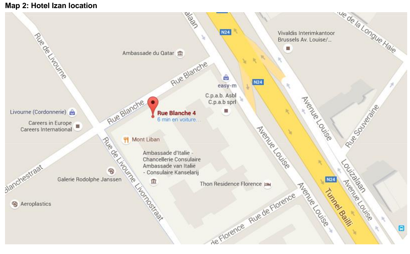
Map 2: Hotel Izan location

You'll need to take the metro from Brussels Midi to Louise then walk around 10 minutes to your hotel.